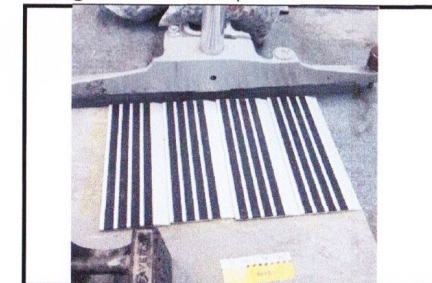
Diagram of test specimen